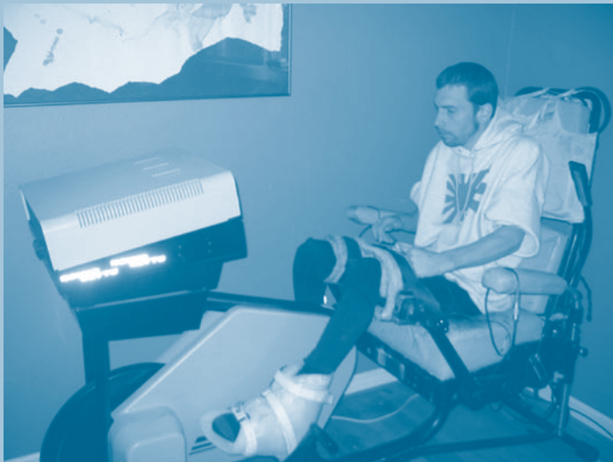
Individual with C6 SCI uses an FES cycle for cardiovascular and muscle strengthening exercise.

Functional Electrical Stimulation (FES) involves applying electrical stimulation to the paralyzed muscles via electrodes placed on the skin, causing muscle contractions that can provide functional movement of the limbs. Repetitive motions of the limbs can provide cardiovascular and muscle endurance training, increase muscle bulk, and provide that “exercise high” feeling. FES systems for cycling, standing and ambulation are available for home use.