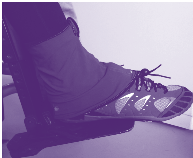
Figure 1. Black ankle-to-thigh cycling leg warmers and gray shoe gaiters are worn underneath pants for warmth.

Bicyclists use leg warmers when riding out in the cold, but on the legs of the well-prepared wheelchair user leg warmers can make a huge difference in staying warm and comfortable in cooler temperatures. After all, your legs are not moving around too much, and even with a thick pair of corduroys or denim pants, they can lose a lot of heat without another layer of insulating fabric. That's where leg warmers are really handy (see Figure 1). Worn under your pants, they only go up to about mid-thigh. This is ideal